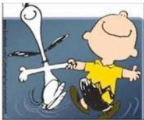
What if today, we were just grateful for everything?